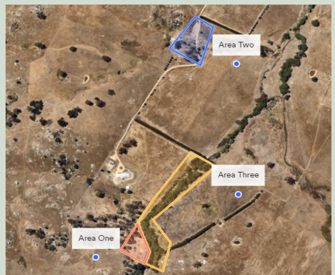
Example of a map from the extension services program

The gorse management plans strategically planned out 3 years of control with the landholders needing to re-evaluate after that. The plans discussed the legal obligation of having gorse, the plants biology and ecological impacts, a map of the property's gorse, the treatment plan, and any additional necessary contacts such as local councils, Landcare groups and contractors.