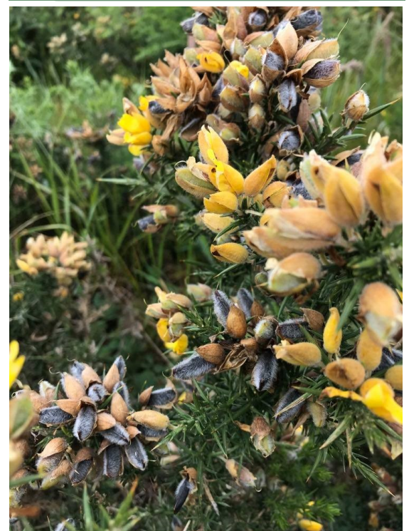
Seed pods on gorse found during a property inspection on the Bellarine