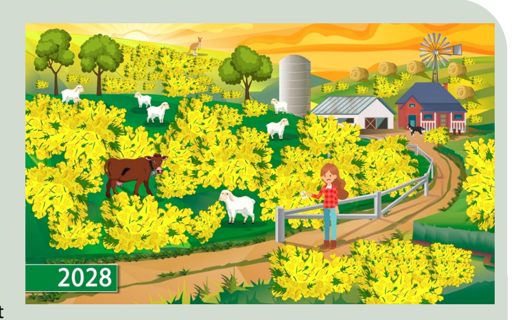
Above: a snapshot of the announcement showing a young girl who has taken over her family farm that is full of gorse

The announcement highlights that gorse is a generational issue, especially if left untreated. The VGT hopes that anyone viewing it will recognise the importance of gorse management for their children in family run businesses.