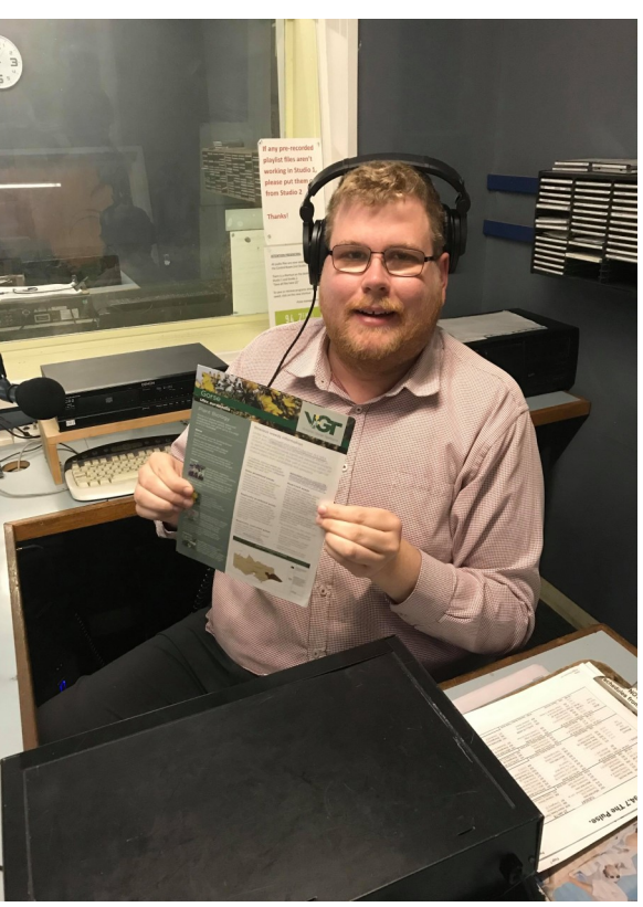
Left: hosts of Voice FM radio holding up the VGT's Best Practice Guide and fire safety flyer after the interview. Right: host of Pulse FM radio holding a Best Practice Guide post interview