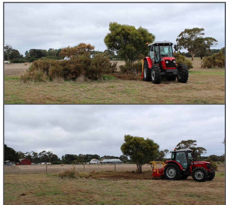
Before and after of gorse being mulched at a field day hosted by the Bellarine Landcare Group.

The Best Practice Guide is available as a download on the VGT website and as a printed brochure. If you would like printed copies please let us know and we will send some out.