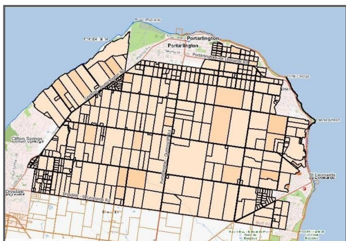
Bellarine Peninsula extension services target area.

Around 400 private landholders are being offered access to extension services comprised of individual property assessments to provide tailored advice on managing gorse and an aerial map showing any infestations found. Also included were open community information sessions.